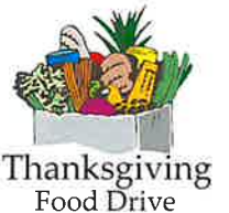
Thanksgiving Food Drive

You are invited to help those in need by donating to the Thanksgiving food drive. All donations will benefit the Franciscan Brothers of Peace food shelf. Donations of non-perishable items may be left near church entrances. Monetary gifts may be placed in the collection basket with "Food Shelf" indicated on the memo line or made electronically via the parish web site. Volunteers are needed to help with the food drive. If you can help transport the food donations, contact Linda at outreach@assumptionsp.org .