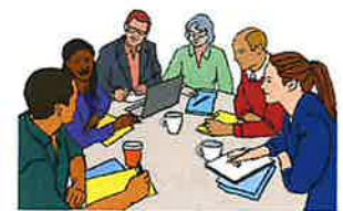
Christianity and Politics